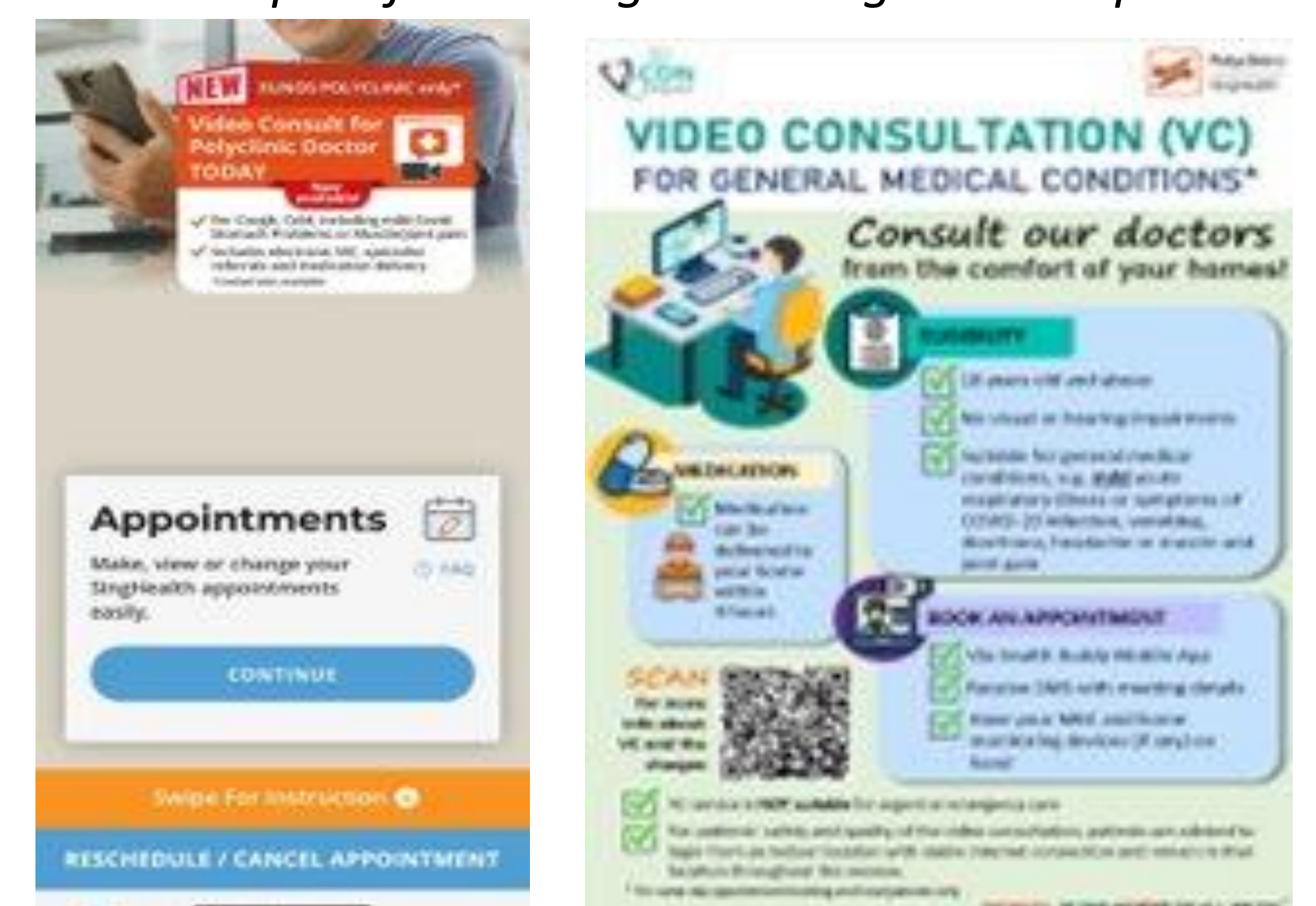
Publicity material to promote awareness of new service