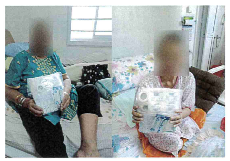
Figure 2. Patients with the Wound Care Kit.

in administering wound treatment with the Wound Care kit. Increasing familiarity to the standardised items in the kit improves work efficiency in the long run, as staff spend less time in figuring out the optimal usage of patient-provided wound care products, allowing them to focus on improving patient experience, and serve more patients in need.