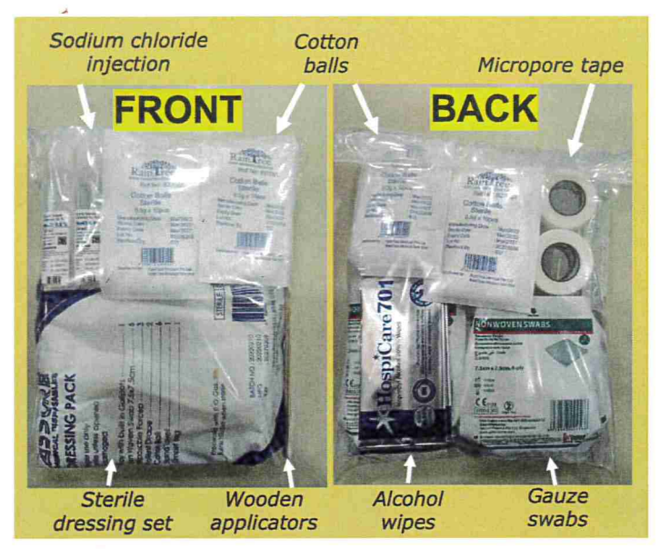
Figure 1. Contents of the Wound Care Kit.

Staff have commented that the Wound Care Kit contained all the essential items required during the home visits, and feel more confident