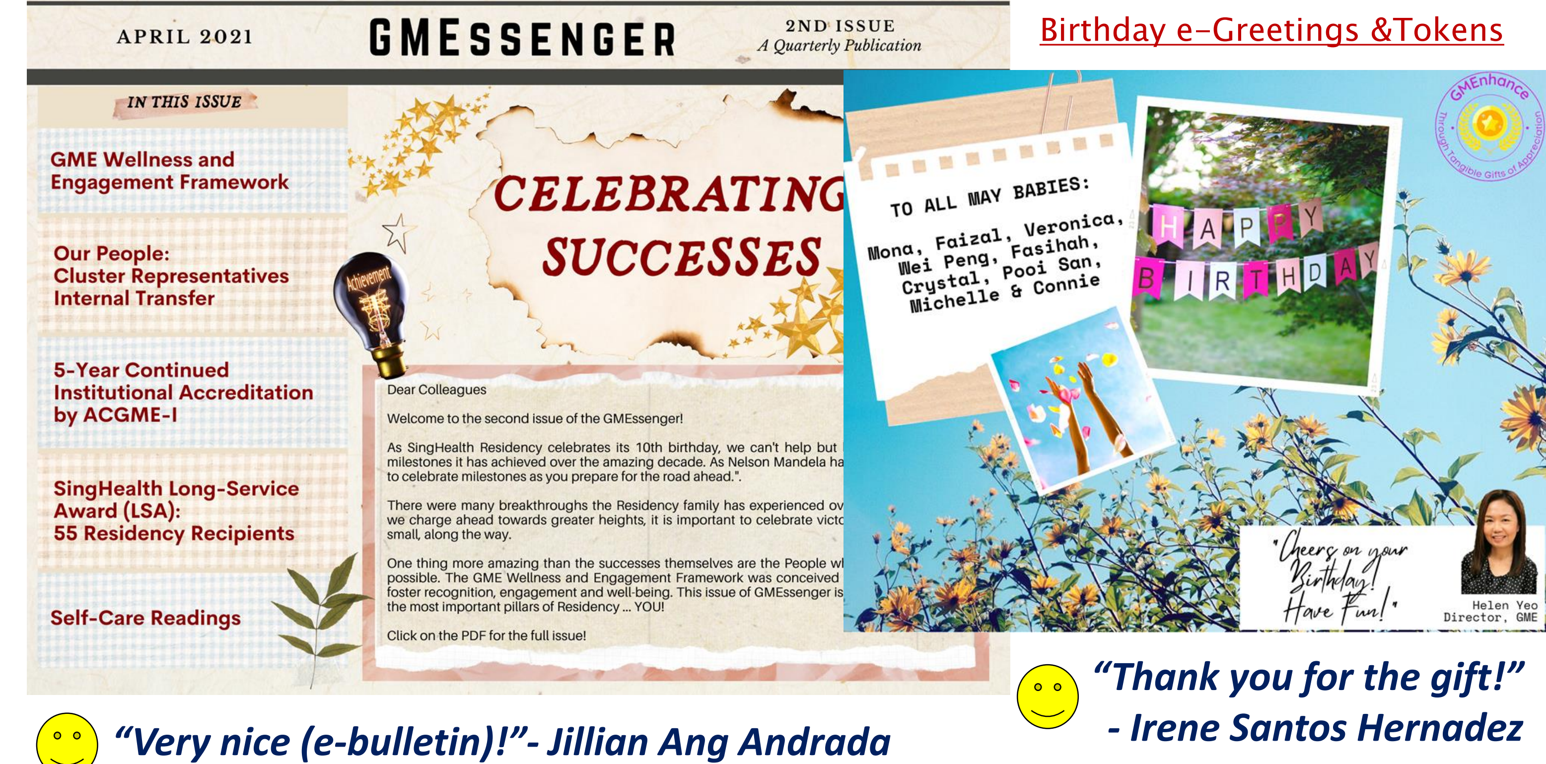
Staff e-Bulletin "GMEssenger"