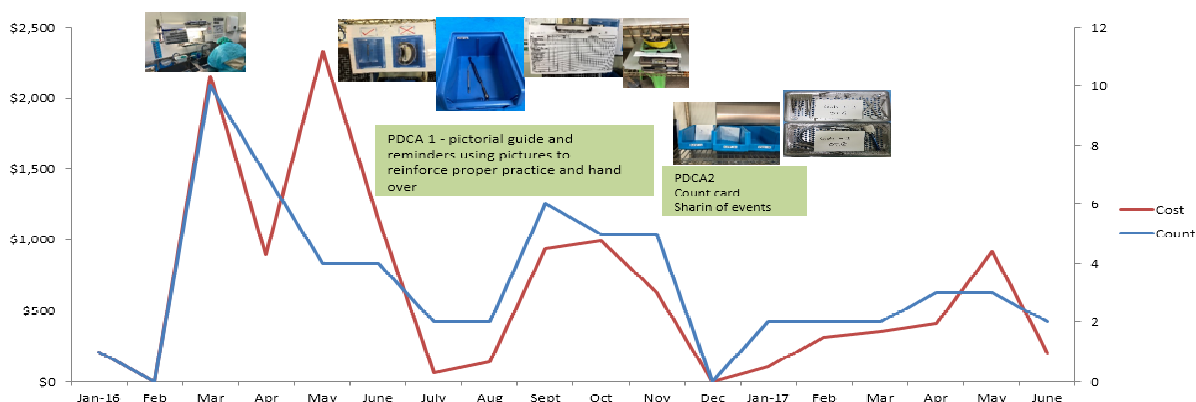
Run chart on the number and cost of missing ophthalmic instrument

The reminders and targeted intervention reduced the total incidences down to 20, equivalent to $2750 in cost, within 6 months (July to Dec 2016). The data remained consistent following next 6 months (Jan to June 2017) with further reduction to 14 incidents and corresponding cost of $2280. Lesson learnt from the project was used to enhance orientation and training program for all new staff.