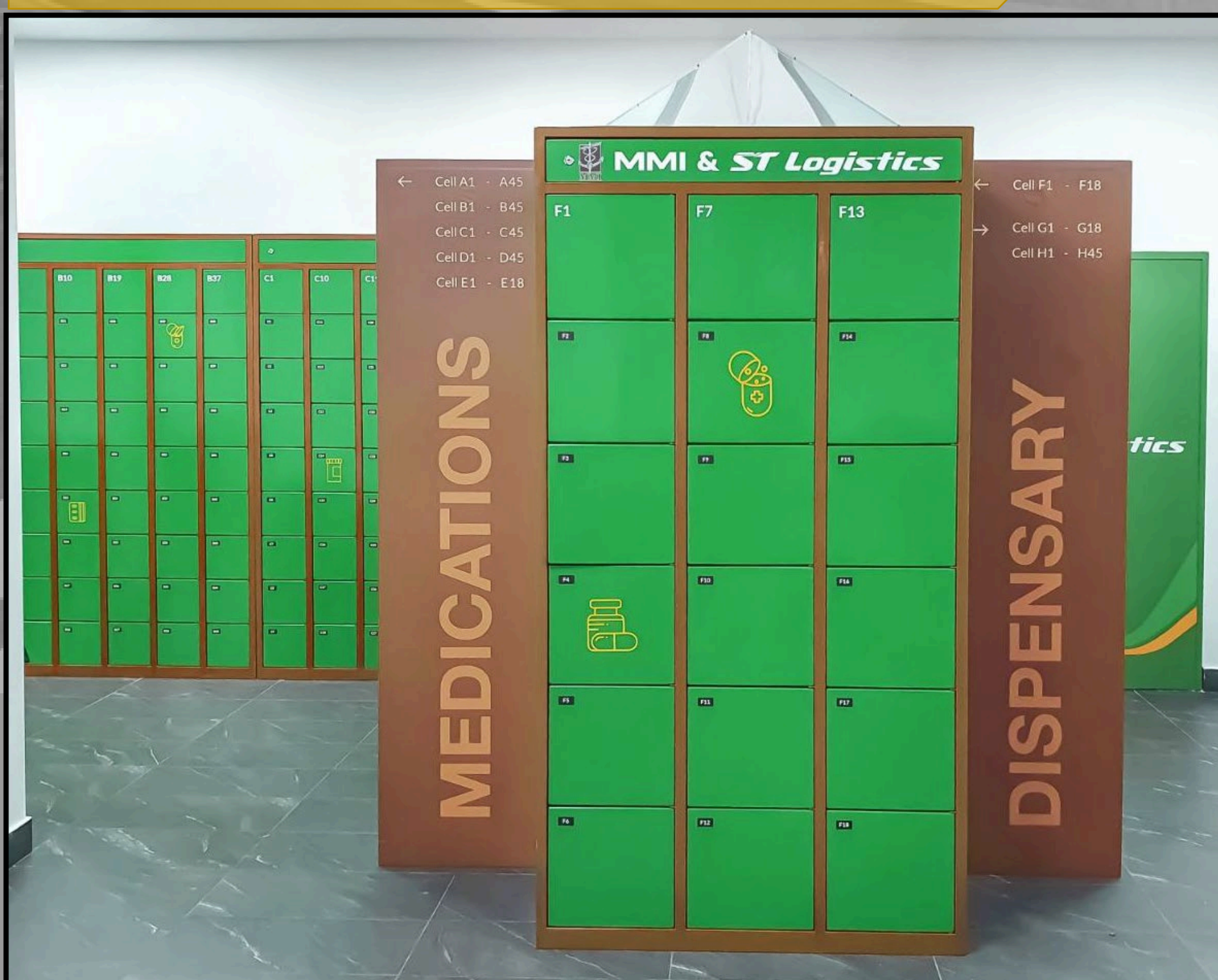
Medical Dispensary System (MDS)