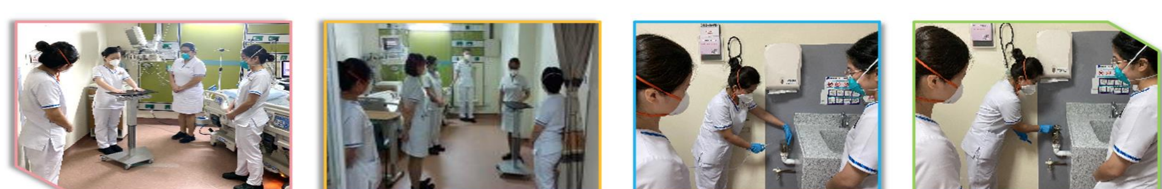
Demonstration on operating the customized Trolley

Roadshows on the demonstration of operating the customised trolley and pipe cover were carried out. Regular hand-on training sessions were also conducted for current and new staffs.