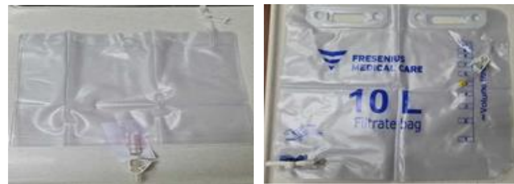
5 litres effluent bag 10 litres effluent bag Figure 2. Process of effluent fluid drainage