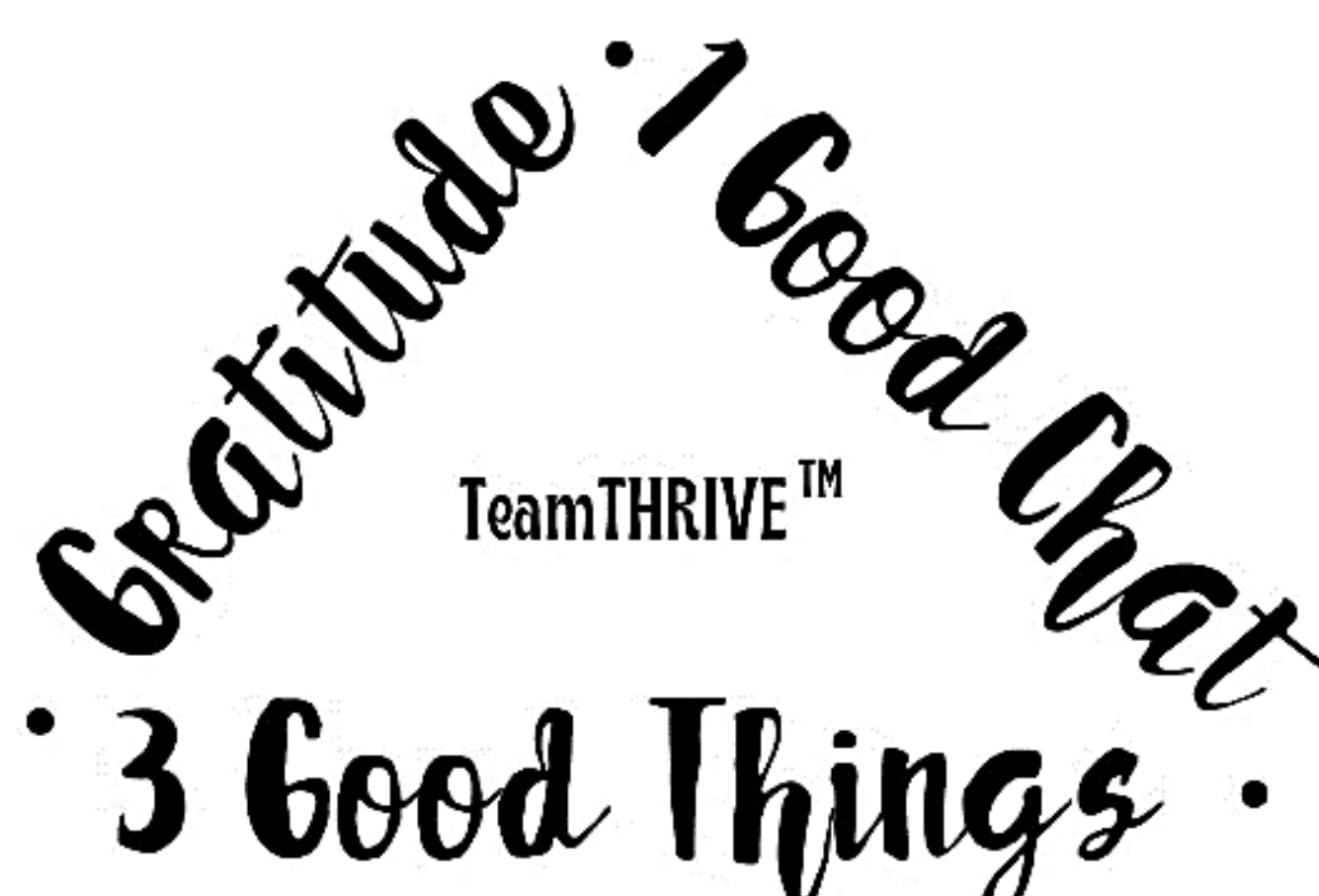
Fig.1 TeamTHRIVE™ Tools

TeamTHRIVE™, a cluster programme in building team resilience and joy at work was introduced in 2021 by SingHealth Duke-NUS Institute for Patient Safety & Quality (IPSQ) to promote teams to thrive with Positive Psychology tools. The curriculum was crafted to provide training and is guided by 3 TeamTHRIVE™ Tools - 3 Good Things, Gratitude, 1 Good Chat (Fig. 1) to cultivate positive relationships.