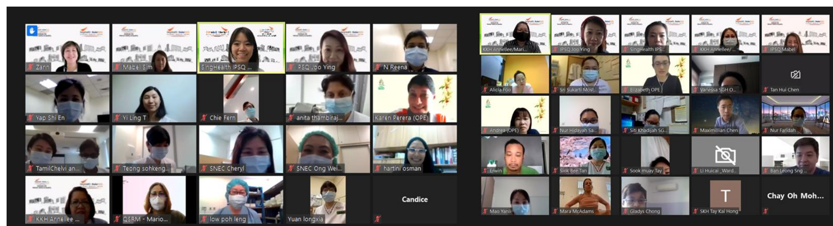
Fig.2 TeamTHRIVE™ Pilot Runs

The approach was structured. Multi-disciplinary healthcare professionals with expertise and passion were invited in the co-design, co-facilitation and co-evaluation of TeamTHRIVE™. The activities and resources in achieving the aim of nurturing Positive Psychology Tools through useful daily practices were examined by the appointed faculty. The content was adapted and contextualised. Two pilot runs were held via Zoom on 18 February and 15 April 2021 (Fig. 2) with a total of 30 participants.