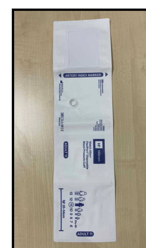
Figure 2: Disposable BP cuffs

These actions were implemented in ward A and B on 23/11/2020.