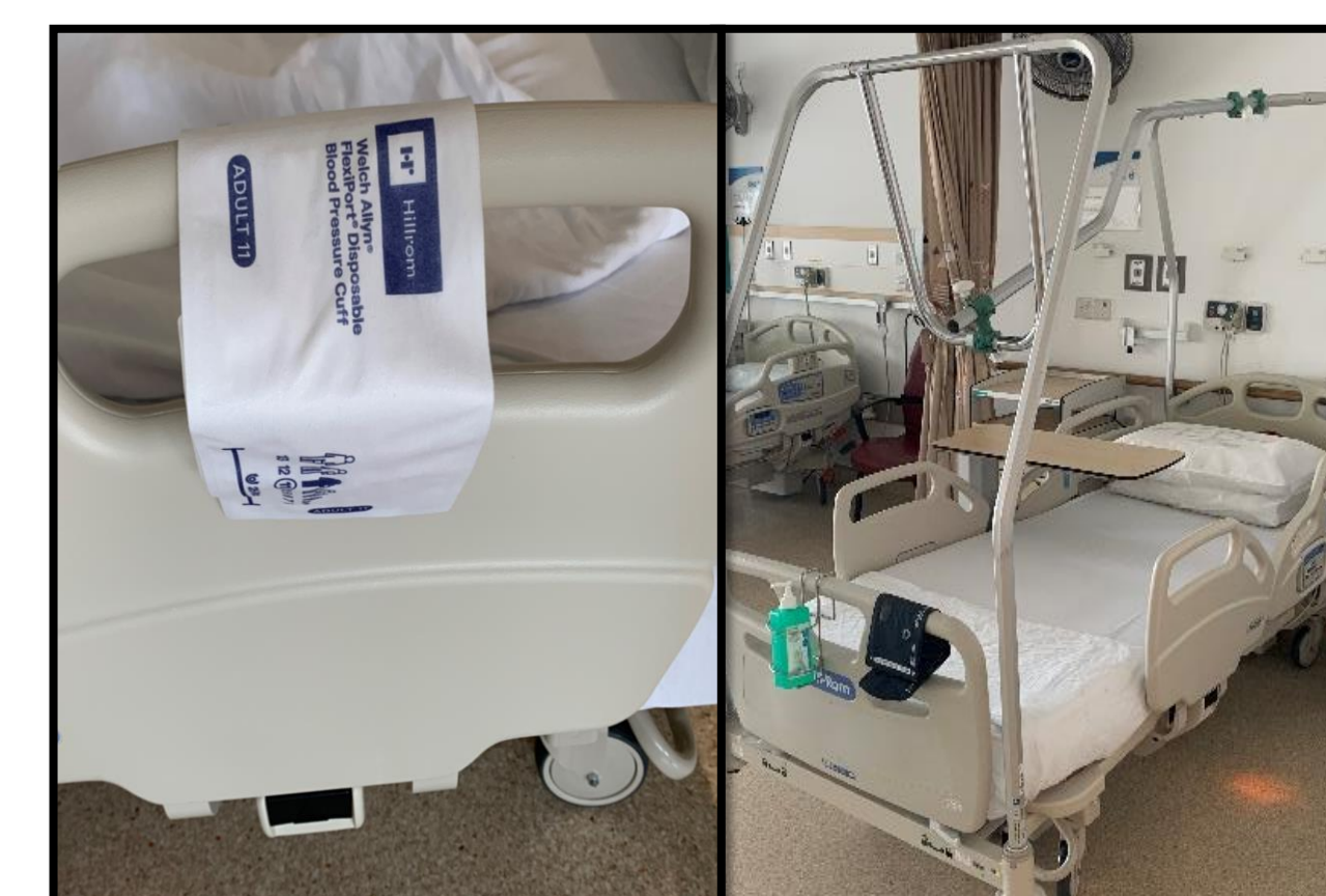
Figure 4: BP cuffs kept on bed rail