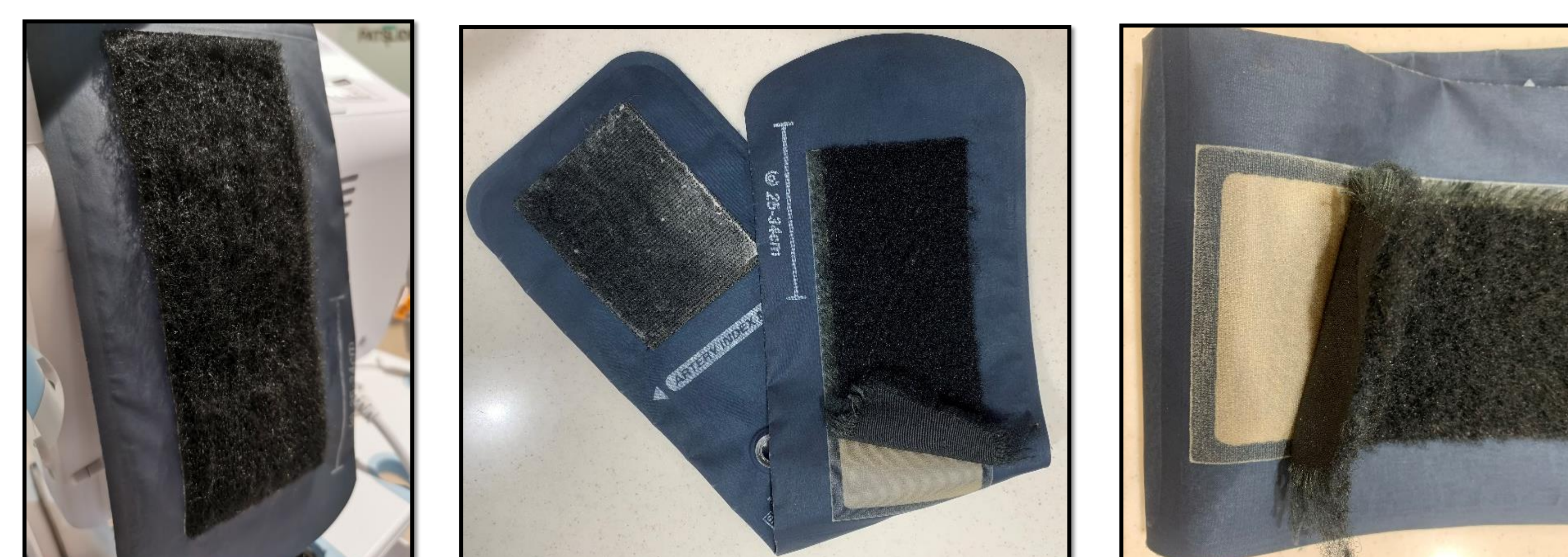
Figure 1: Worn out blood pressure cuffs

3. Condition of shared BP cuffs after frequent cleaning were observed to be worn out (Figure 1). Due to the condition of BP cuffs and velcro material on the cuff, routine disinfection of BP cuff is difficult and may not be sufficient for thorough cleaning. BP cuffs contaminated by MRSA become infection sources and could act as a vectors for transmission of MRSA and multi-resistant organisms.