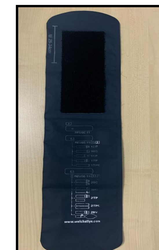
Figure 3: Reusable BP cuffs