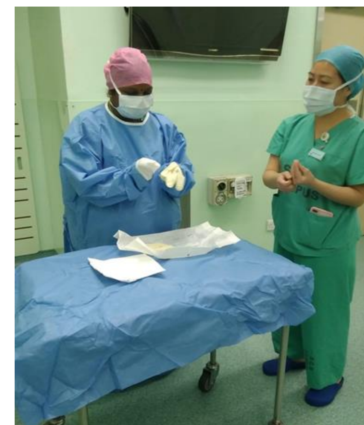
CI teaching gloving and gowning