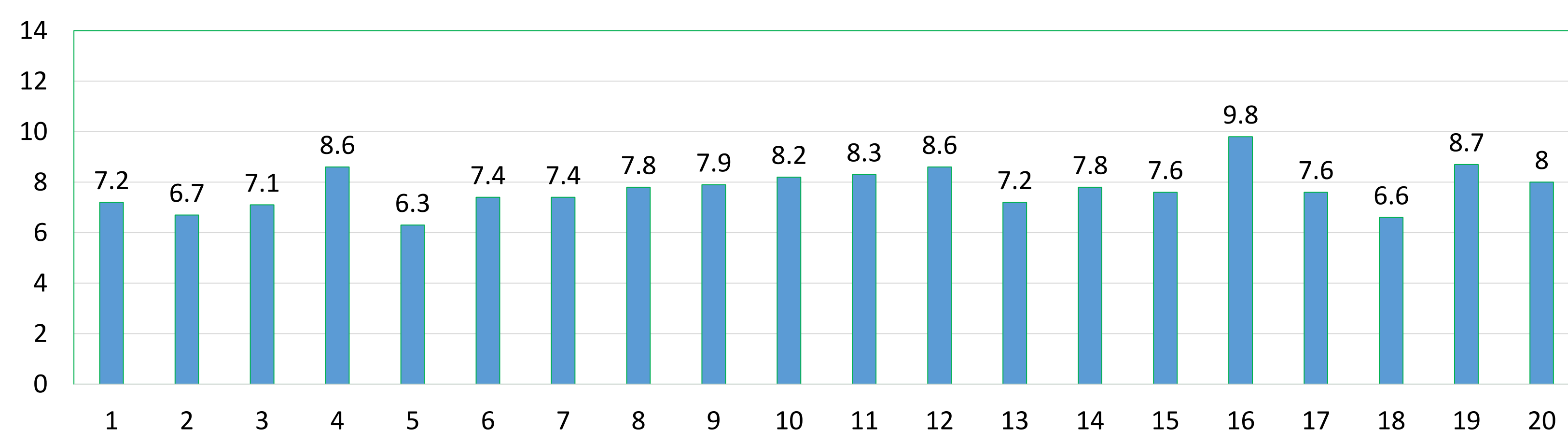
Post Intervention HbA1c