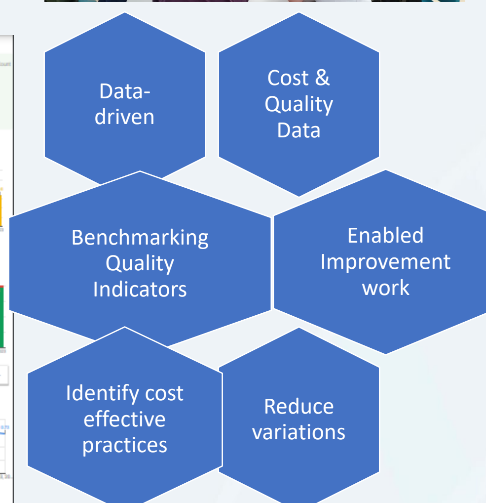
Figure 1. Application of NUHS VDO framework with data visualization and PDSA improvement cycle in SACH