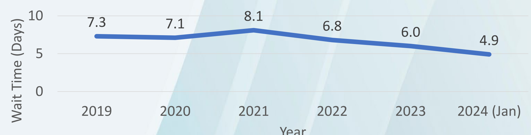
Figure 3. Wait time (days) from referral to admission