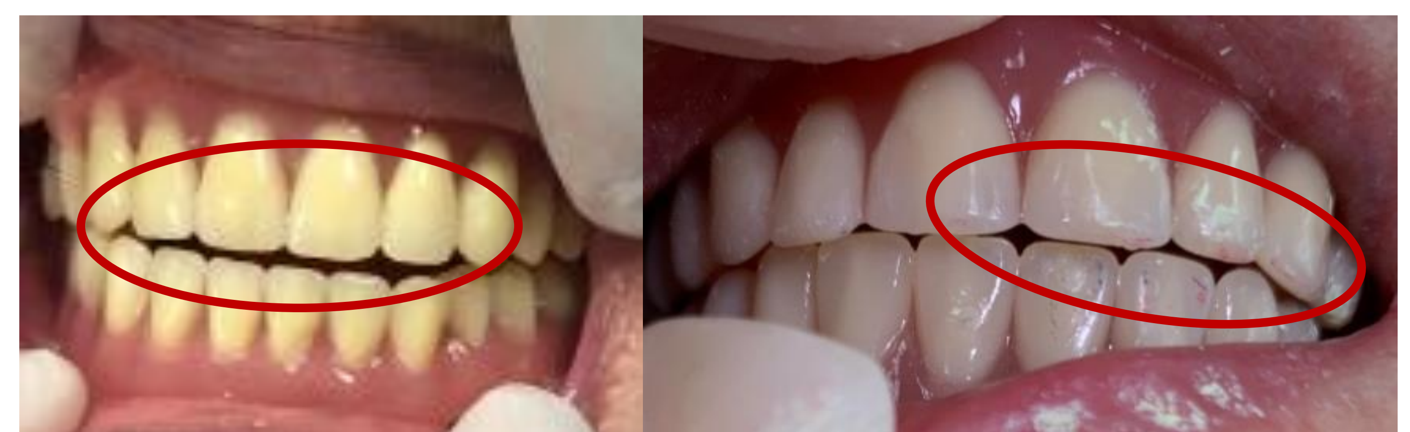
Figure 3. Common mistakes by technicians; open bite present