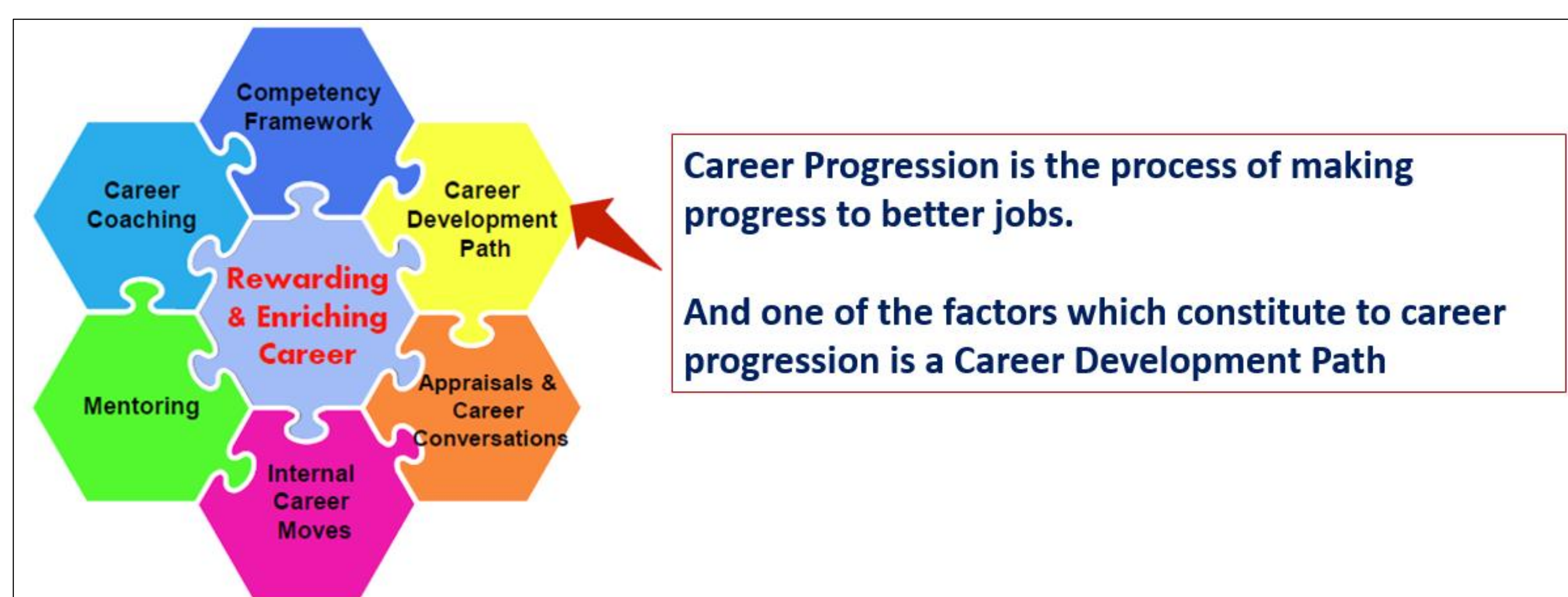
Figure 1: Career Development Path & Competency Framework for Administrative & Ancillary staff For Admin Townhall, 4 July 2016

From the Career Development Path & Competency Framework (Figure 1) for Administrative & Ancillary staff for Admin Townhall on 4 July 2016, career progression is one for the contributory factors that rewards and enriches career.