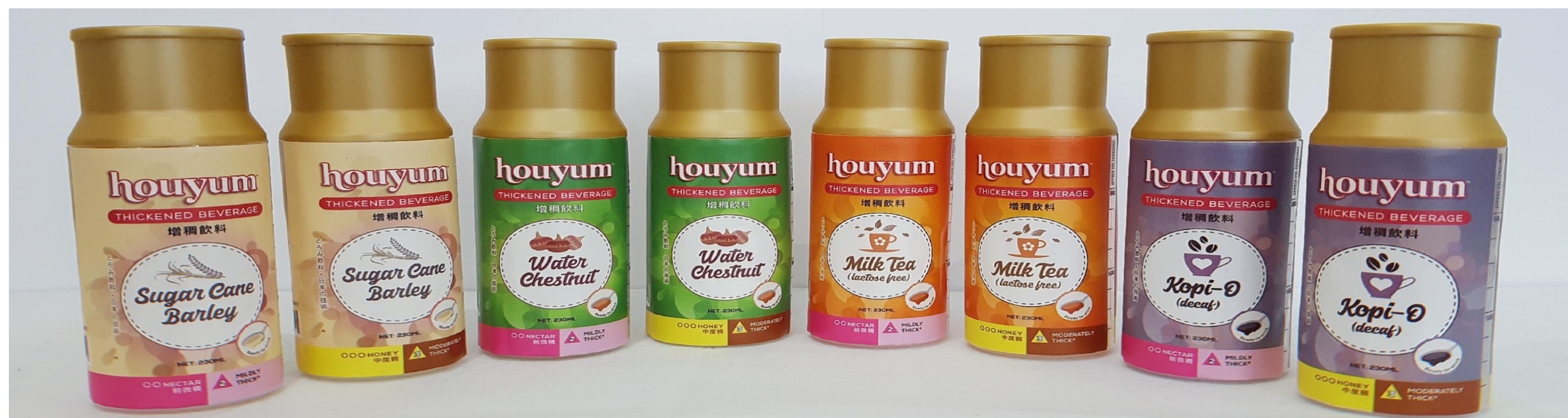
Figure 2: All locally-favored PB