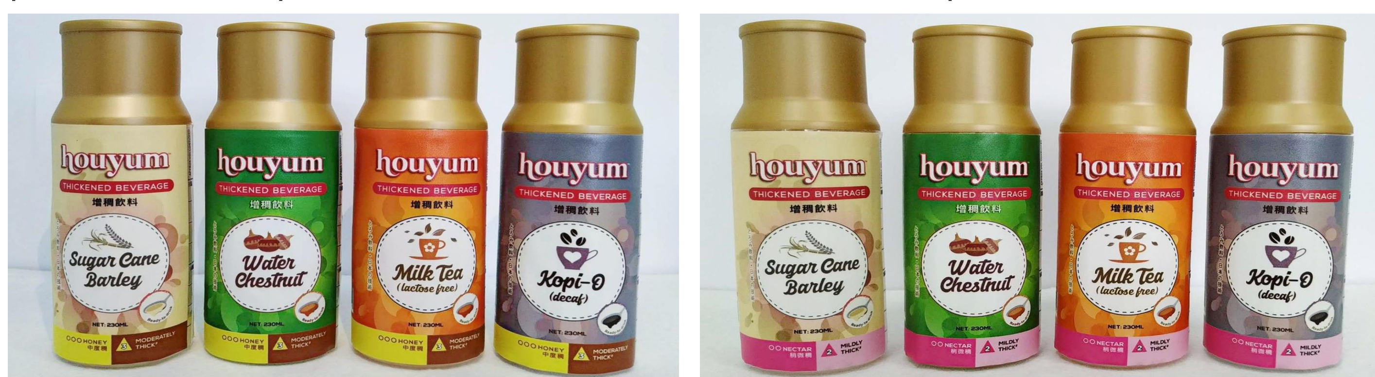
Figure 1: Locally-favored PB Honey thick (left) and Nectar thick (right)

The development of locally-flavoured pre-thickened beverages (PB) aims to target the two most significant gaps, namely the insufficient access to thickened fluids as well as the lack of flavours of thickened fluids. Thus increasing fluid intake for patient to improve hydration level and their quality of life.