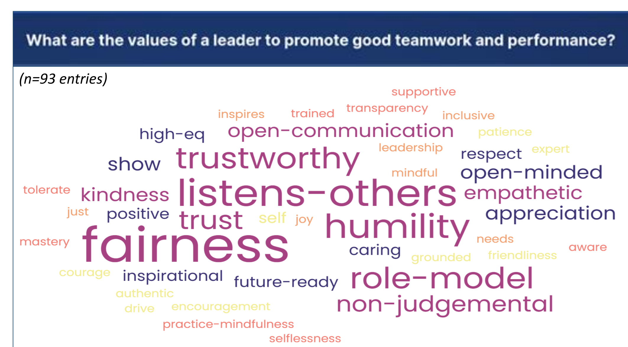
Fig 4 Example of Word Cloud Activity (Consolidated Responses)

From the evaluation, 100% of respondents (n=36) agreed programme objectives were met. 100% was satisfied with TeamJOY™. Rich sharing and reflections through the word cloud activities (Fig.4) show participants common perspectives and concerns which made them feel validated.