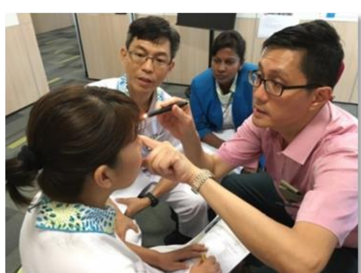
Nurses trained by ophthalmologist