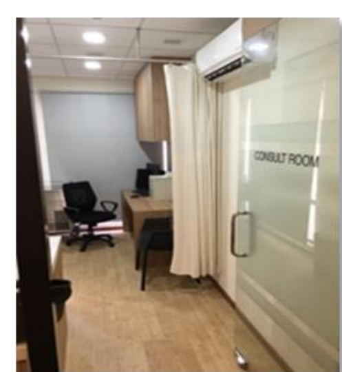
Wellness Kampung consult room