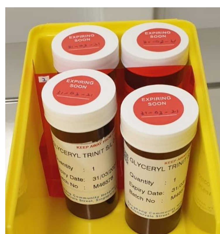
"Expiring soon" GLYCERYL TRINIT S/L 0.5MG TAB 30's

3. ALPS staff removes drugs that are expiring in less than 3 months and places them in quarantine back at warehouse. Once these drugs are expired, ALPS will discard them on behalf of the wards.