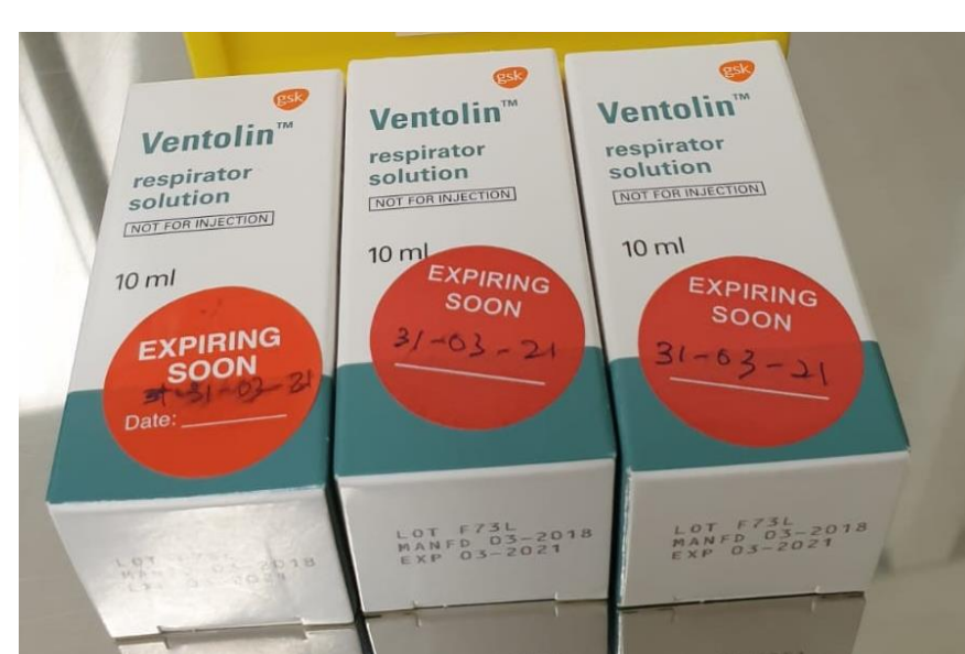
"Expiring soon" SALBUTAMOL SULF 100MCG INH 200D

2. ALPS staff pastes orange 'expiring soon' labels on those expiring less than 6 months.