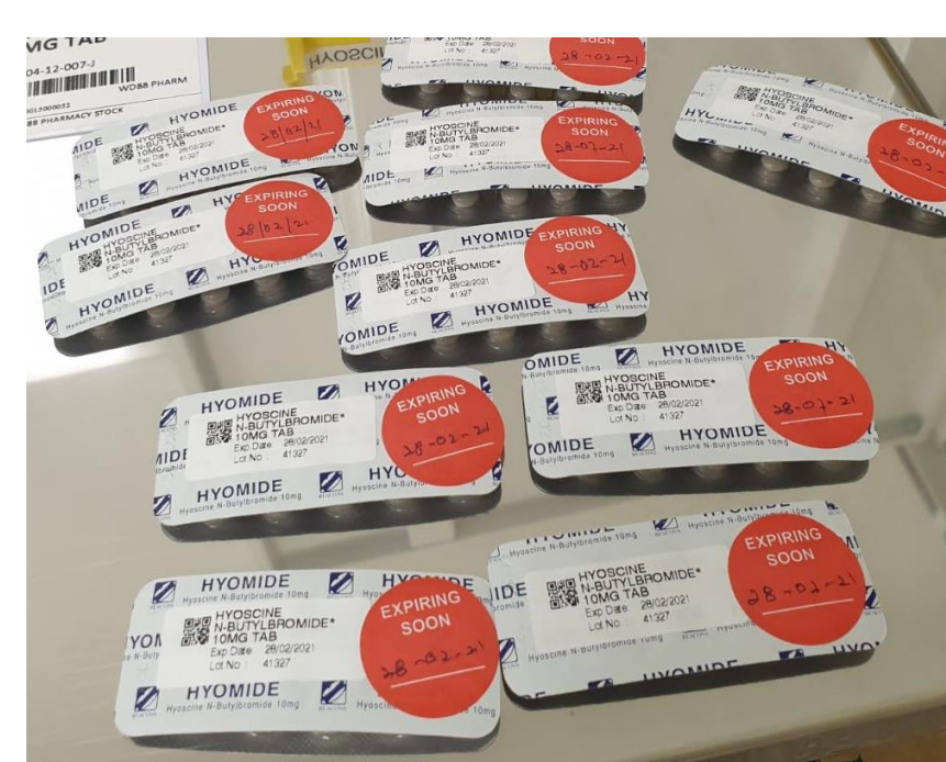
"Expiring soon" HYOSCINE N- BUTYLBROMIDE 10MG TAB